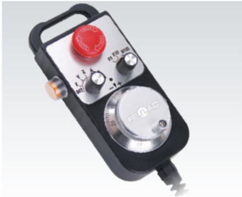
FNC ELT 100